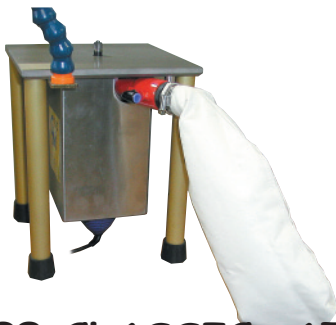
CM 200 CLASSIC AZ-092

Electronic variable-speed motor with foot pedal. The foot pedal is equipped with an adjustable 5-position speed limiter and a manual variable-speed control button